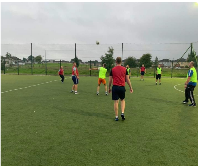
OTM Traveller Men's soccer team in action!

In October 2021 a sea fishing trip to Sligo was organised for 8 Traveller men. This trip was planned as part of a survey with the Traveller Men. We went on the trip on Wednesday the 27 th of October. The Day consisted of a bus to and from our location a chartered boat for 3 hours of sea fishing. We went to a Gastro pub venue for some food and returned back home. The men really enjoyed the day with lots of laughter, and the Traveller men asked if we could make this an annual Activity/ Event each year.