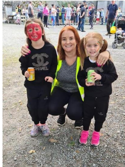
Lots of fun activities for the young people at the Traveller Pride Event in Charleville Castle, Sept 21

In the run-up to Christmas, members of OTM Youth also participated in ice skating activities at Blanchardstown ice rink in Dublin. Members of the youth project in Birr were also included in this trip which finished up the year nicely.